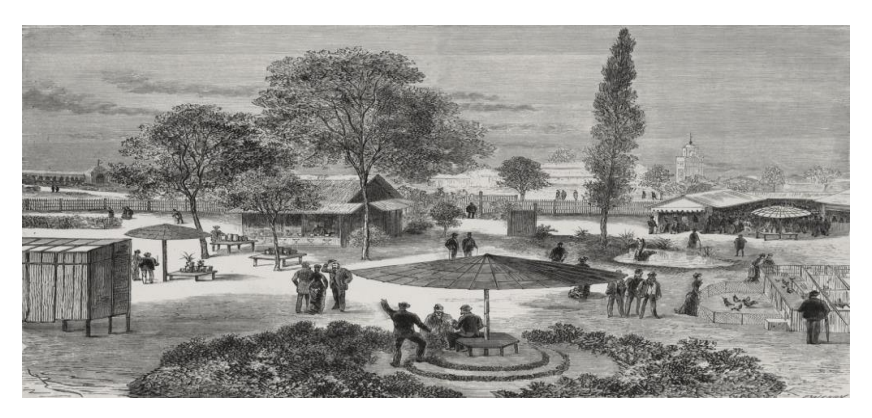
Photo 3. Photo of the Japanese farm, Champs de Mars, World exhibition, Paris, 1867, Commission Imperiale du Japon, (1868). Histoire de l'Art du Japon. [History of Japanese Art.] Paris: Maurice de Brunoff

The first Fench General Consul in Japan, Gustave Duchesne de Bellecourt, reports on the event in the Revue des deux mondes and expresses his admiration for porcelain and less for weapons, which also occupied a significant place in the exhibition.