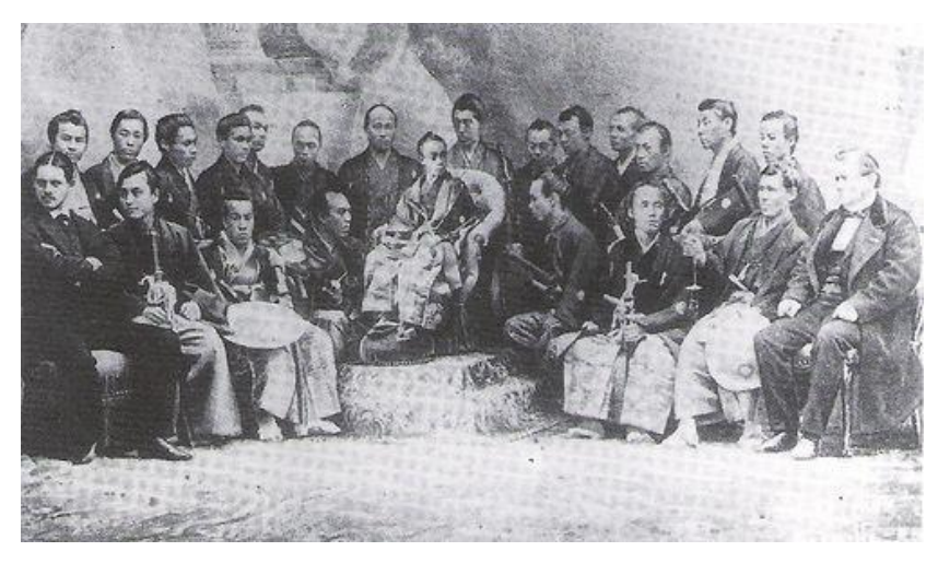
Photo 1. Photo of Japanese delegations at the International exhibition, Paris, 1867, Commission Imperiale du Japon, (1868). Histoire de l'Art du Japon. [History of Japanese Art.] Paris: Maurice de Brunoff

But the militant Satsuma and Chōshū (薩摩 長 州 同盟) alliance, founded by the heads of the feudal domains of Satsuma and Chōshū in 1886 to restore imperial Japan, also has its own delegation.