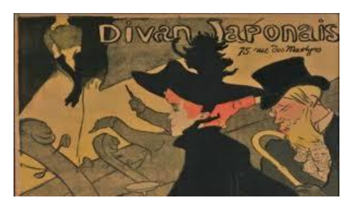
Photo 6. Toulouse Lautrec, Divan Japonais, Frey, J. (1995). Toulouse –Lautrec: A Life. London: Orion Publishing.

In order to show all segments of the rich Japanese civilization at one of the next World exhibitions, which again took place in Paris (where the Bing, Barte and Guimet collections attracted a lot of attention when it comes to decorative art), the Japanese Imperial Commission publishes an extensive two-volume publication Japan at the 1878 Exposition Universelle (Le Japon, Exposition universelle de 1878).