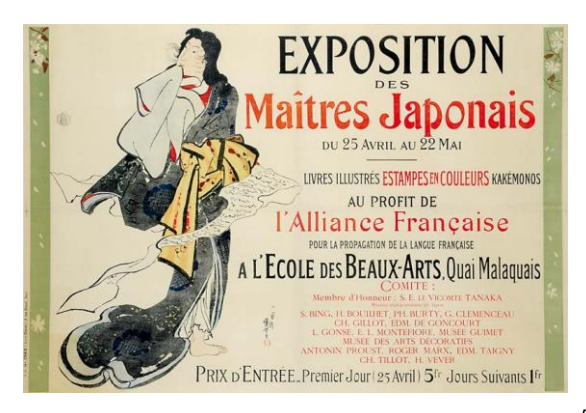
Photo 7. Jules Chéret, Exposition des maîtres japonais à l'École des Beaux-Arts, poster Journal of Japonisme. (2017). Netherlands: Brill, vol 2, p.11

During this period, the studies lasted for nine years and students were selected from the ranks of young people aged thirteen to sixteen. Enrollment issues were statutory and covered six areas. The study program included four sections: history and geography, philosophy, law and mathematics, and in two separate areas were studied music and calligraphy and medicine. The seriousness of the preparation of the Japanese Imperial Commission for the Exposition Universelle in 1878 is also evidenced by a precise account of the detailed development of the educational system, which at the time of writing this study is already numbered by ten universities. During this period, France sent professors to Japan to teach at Japanese universities. In sales exhibitions of Japanese artists's works, a portion of the proceeds is spent on expanding French language studies and establishing a Franco-Japanese language alliance.