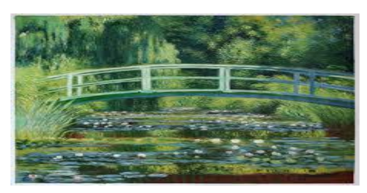
Photo 5. Claude Monet, The Japanese Footbridge Wildenstein, D. (2019). Monet or The Triumph of Impressionism. Cologne: Taschen.

Edgar Degas's drawings and pastels express a reflection of Japanese compositional style, and the wide-area design in one color is found with Gauguin and Toulouse Lautrec.