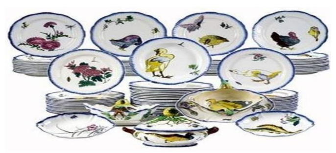
Photo 8. Traditional service Satsuma ware, Eriksen, S. & De Bellaigue, G. (1968). Sèvres Porcelain. USA, AbeBooks.

The porcelain factory in Sèvres is increasingly inspired by Japanese designs (the first service under the name "Rousseau" is manufactured), and Satsuma ware, or Satsuma porcelaine) will become one of the most famous and most exported Japanese products during the Meiji period.