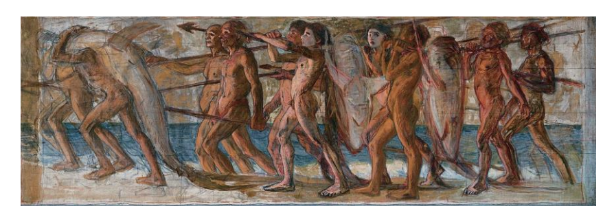
Photo 11. Aoki Shigeru, Seafood, Fleming, J. & Honour, H. (1902). A World History of Art. London: Laurence King Publishing

Aoki Shigeru, a Japanese painter, was inspired by the French Impressionists, and his most famous painting, Umi no sachi (海 \mathfrak{O} 幸 ), Fruit de mer, or Seafood, makes him one of the greatest painters of the Meiji period.