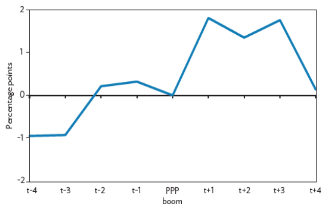
Figure 2. GDP increase prior to and after investing in PPP