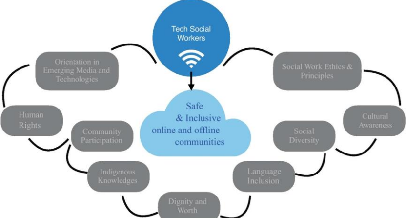
Figure 2. Social work skills and knowledge to promote human rights in emerging technologies (Kirwan 2019, p. 446)

Bearing in mind the functioning of the social welfare system, one of the key observations in the context of the digitalisation of social work is that automation (of social services) is still an insufficiently recognised field due to contradictions in the rules, but also due to the complexity of cases in different social services (see also Kirwan, 2019). Regarding the digitalisation of social work, it should be emphasised that technologies do not act in isolation from people, and perhaps this is best explained by the phrase 'digital dualism,' coined by Jurgenson (2011). He highlights the dangers of focusing on one side, be it the human side or the technology side. That is, digital and material reality are not separate and actually coconstruct each other, even in the domain of social work, which can be seen in Figure 2 , which shows what needs to be incorporated into digital social work.